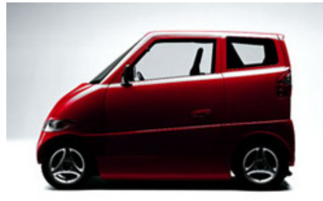
The Tango T600

I investigated a number of Microcars for the case study. Many were too wide, too slow, limited range or one off conceptual vehicles that were not market ready for mass production. The Tango T600 by Commuter Cars satisfied the criteria and was subsequently contacted for this case study.