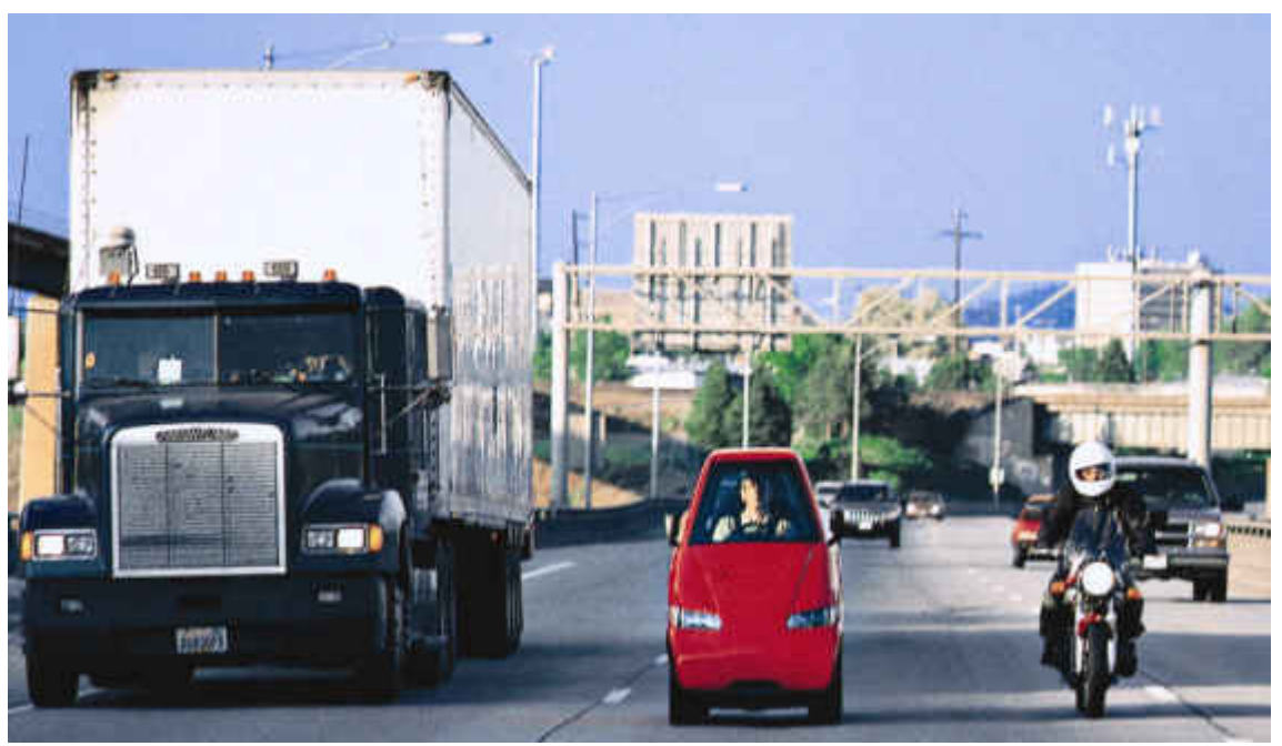
Tango T600 on the freeway

There must be a better way to plan transport than continuing to make the same expensive mistakes over and over again.