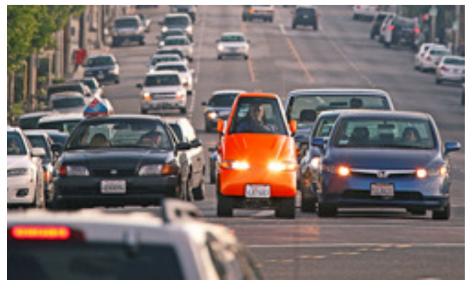
Tango T600 Ultra-narrow electric vehicle

www.projectmicrocar.co.nz feedback@projectmicrocar.co.nz