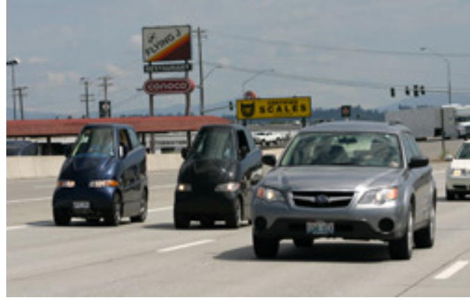
2 x Tango T600 sharing a motorway lane

A Microcar is the smallest automobile classification, usually applied to very small cars (smaller than city cars). <u>http://en.wikipedia.org/wiki/Microcar</u>